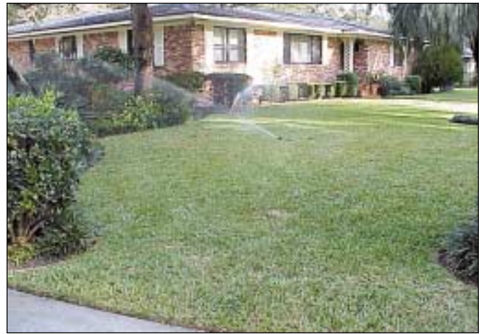
Figure 10. Poor design; system does not match irrigation requirements. The area needs to be rezoned with landscape and turf separated.