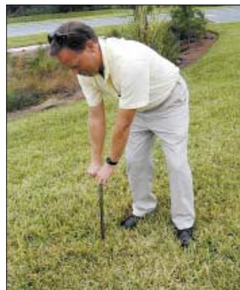
Figure 22. Taking a soil sample.

Although it may not be an essential practice for the everyday maintenance of a healthy landscape, testing to determine the soil's chemical properties before installing turfgrass or landscape plants is a recommended practice. Through soil testing, the initial soil pH and P level can be determined. Soil pH is important in determining which turfgrass is most adapted to initial soil conditions (bahia grass and centipedegrass are not well adapted to soil with a pH greater than 7.0). Since it is not easy to reduce the pH of soil on a long-term basis, you should use St. Augustine grass or bermudagrass on high-pH soils.