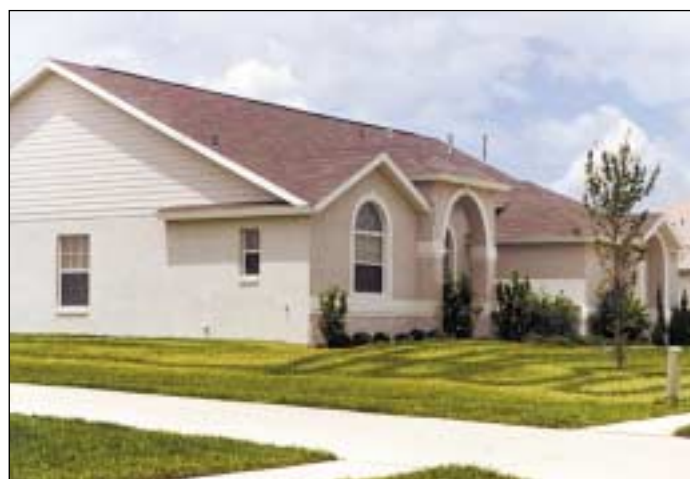
Figure 19. Streaking on a lawn caused by poor application techniques.

One of the most common nitrogen fertilizers is urea (46 percent N), which is a water-soluble, synthetic organic nitrogen fertilizer with quick N-release characteristics. Urea can be applied as either liquid or granules, and is subject to volatilization, or loss of nitrogen to the air. If urea is applied to the turfgrass surface and not incorporated through proper watering, significant quantities of N can be lost through volatilization.