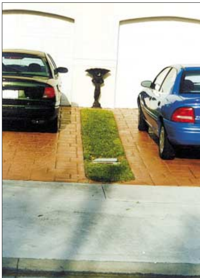
Figure 6. Narrow strips are difficult to maintain.

The long-term value of a landscape depends on how well it performs for its particular objectives. Performance is often directly related to matching a site's characteristics and a client's desires with plant requirements. Therefore, the first step in selecting appropriate plants for a landscape is to conduct a site evaluation, which may consist of studying planting site characteristics such as the amount of sun or shade, salt spray, exposure, water drainage, soil type, and pH. These characteristics will most likely differ between areas on the same property. For example, the area on one side of a structure may have significantly different light conditions than an area on the other side. The second step is to select plants with attributes that match the characteristics of the planting site.