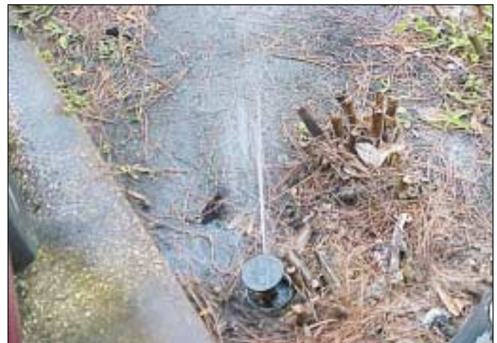
Figure 12. Object is interfering with spray pattern, resulting in poor distribution uniformity.

Figures 9–15 depict some examples of improper irrigation system design or installation.